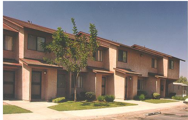
Photo: Community located on Calle Primera in San Ysidro